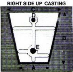
UPSIDE DOWN CASTING