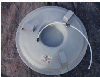
BLACKTHORN'S AIR RELEASE and Metal Feet ATTACHED